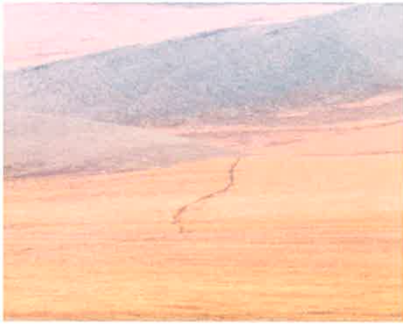
Snowmachine and ATV trail cuts into the tundra