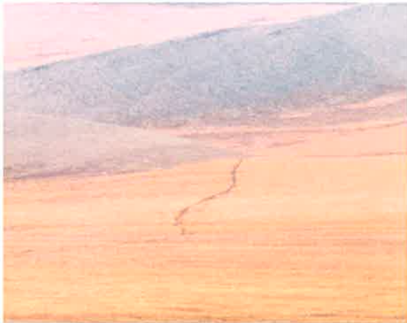
Snowmachine and ATV trail cuts into the tundra